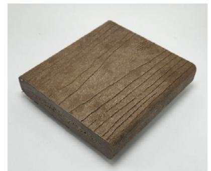
Wood Grain Texture