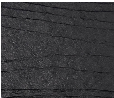
Wood Grain Texture

Additional costs and lead time apply—an embossed wood grain modification to the standard texture after the precast process. This texture is only available for up to 12" broad profiles. Embossment depth may vary due to product tolerances. It is not recommended for high-use applications. This texture is for mid to low-use residential stairs, landings, and decks.